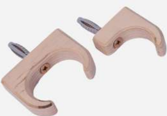
Wooden Paddle Holder