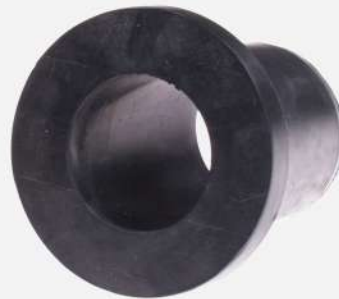
Rubber Oar Stops