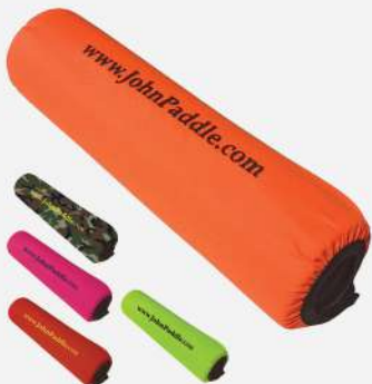
SUP Paddle Protection