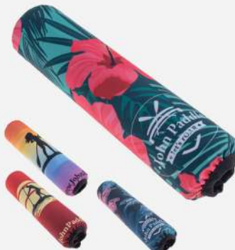
Printed SUP Paddle Protection